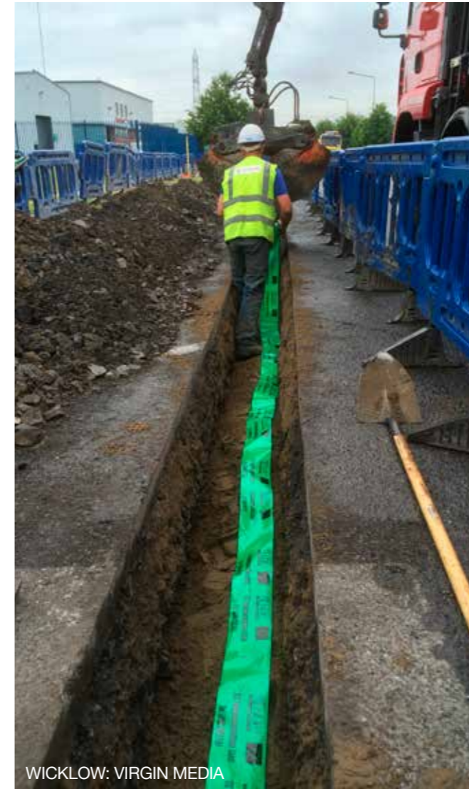
WICKLOW: VIRGIN MEDIA