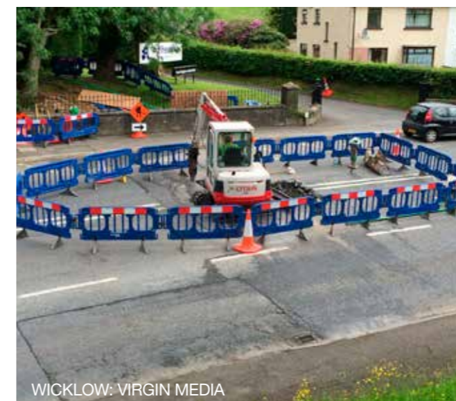
WICKLOW: VIRGIN MEDIA