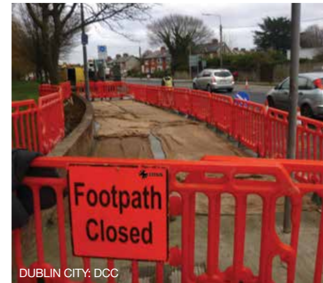
DUBLIN CITY: DCC